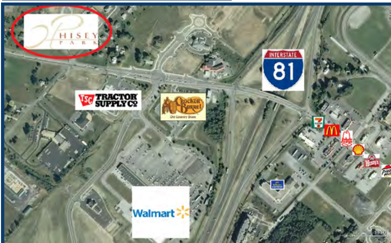
High Traffic Location With Great Visibility